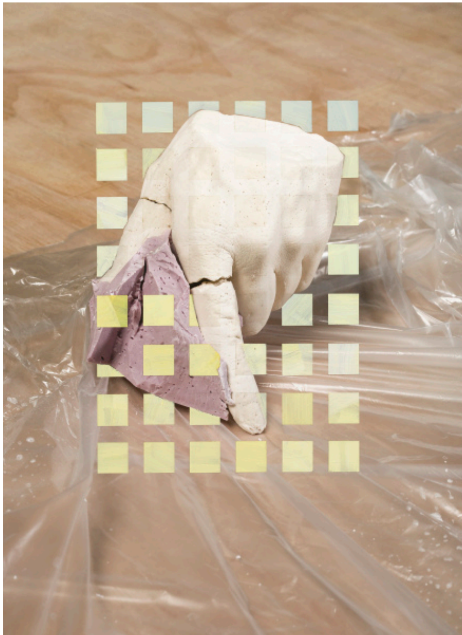
Hand Study 003, 2015

had noticed that in the studio I was being much more playful. I was allowing myself the space to create nonsense. I didn't have to have an intellectual idea before making. I believe this playfulness largely comes out of being in analysis for many years. Coming from the hyper-rational world of software and the intensely intellectual space of the Whitney ISP, play didn't exactly come naturally to me. Reading Playing and Reality had a tremendous impact on me. My early work with the Aggregates was quite systematic and the fold was perhaps a marker of play. Now I like to imagine that the fold of the Aggregates has transformed into drawing and painting. I have always drawn and painted, but this is a landmark show for me in that it's the first time I have shown any painting or drawing. To go back to the title of the show, the painting is the play and it's within the context of the reality of the photograph. I don't make any universal claims that painting is inherently more playful, but for me, in this moment, it is; and the combination of painting within the space of my layered, rephotographed photos has led to a good many surprises. Of course, like creativity, play can't be willed, all you can do is show up and set forth.