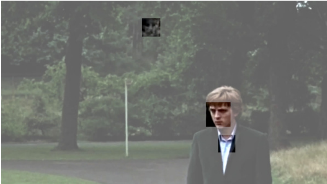
Still from Portrait Landscape (Object Classifier series) , 2015

JB: How did Portrait Landscape (and I hope subsequent series) come into being? Aside from the work at Kansas in 2012, is this the first video you have presented?