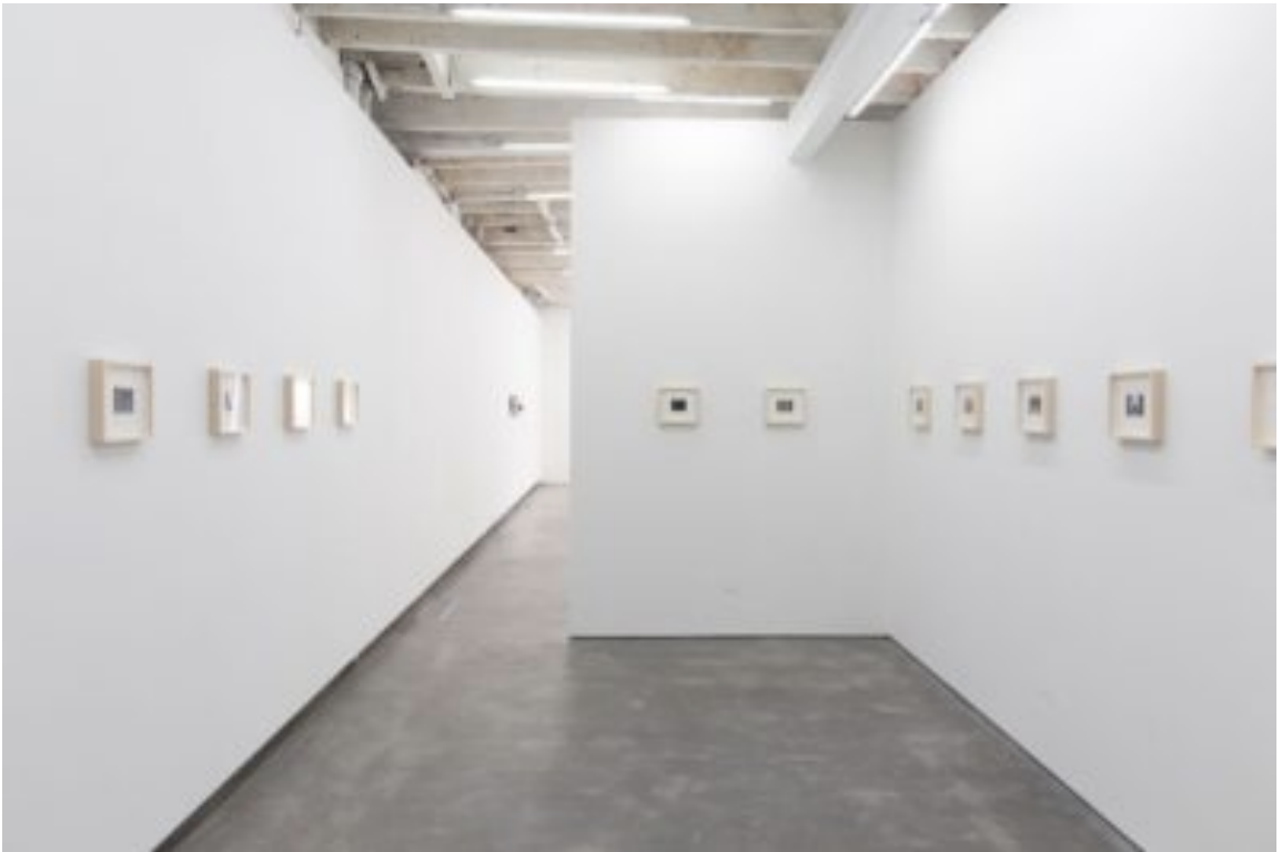
HOTSPOTS at On Stellar Rays