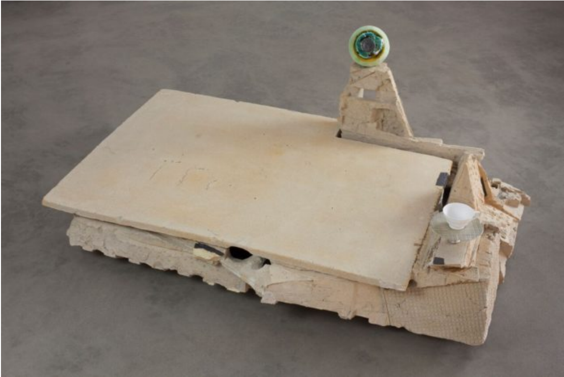
Work by JJ Peet

The first thing that seers itself into your line of vision are the 12 panel paintings by Rochelle Feinstein which began in 2008 to mark American-led invasions of the Middle East and the halftone dots forming the outline of globes that seem to be turning on a wobbly axis embody the various definitions of the word “hotspots” as a Wi-Fi signal location, a jumping night spot, central hotbed of activity, etc. The dots or hotspots appear to be signed on the surface. The overlapping colors resemble wavy heat images of a mirage. And like a mirage that manifests in the desert, it can be an illusion or a saving grace.