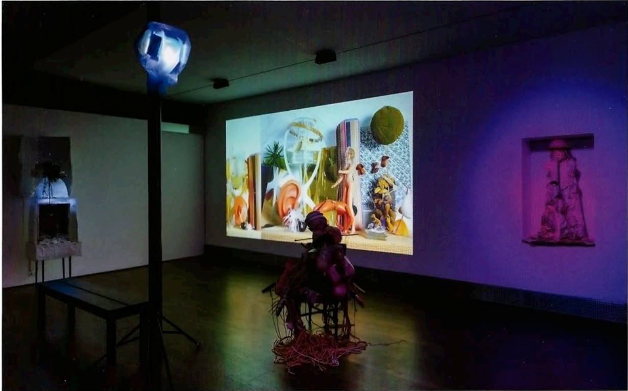
THE BIBLE , 2014. Installation view. Mixed media including video projection, dimensions variable.

2015 AWARDS IN PAINTING, SCULPTURE, PRINTMAKING, PHOTOGRAPHY, VIDEO, AND CRAFT MEDIA