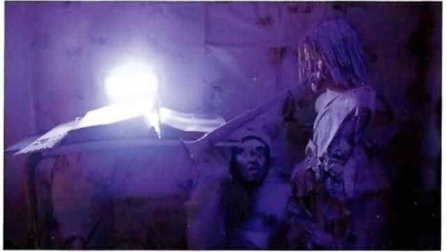
THE BIBLE, 2014. Stills from HD video trailer, 3 minutes, 53 seconds (full version 60 minutes). To view, visit www.louiscomforttiffanyfoundation.org .